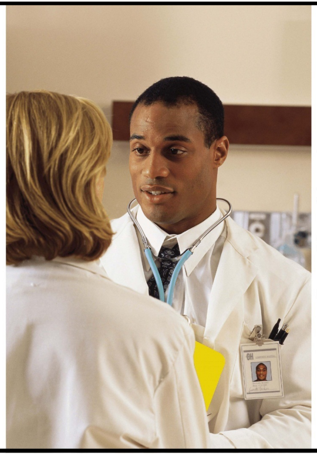
A Guide to Maryland Law on Health Care Decisions (Forms Included)

STATE OF MARYLAND OFFICE OF THE ATTORNEY GENERAL